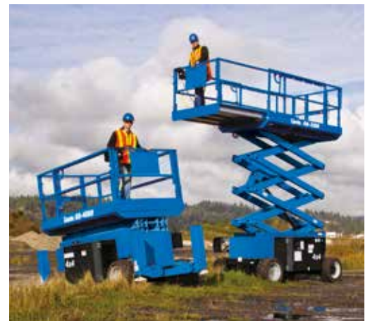
The GS-69 RT models feature an extension deck which can be extended between 91cm (3ft) and 1.52 m (5ft).

The Genie GS™-4069 RT is the world's first 12.12 m (39 ft 9 in) full drive height rough terrain scissor lift in its class. The GS-2669 RT and the GS-3369 RT models are also equipped with this feature, providing ultimate end user 'up time' while on the jobsite.