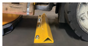
Forklift Wheel Stop