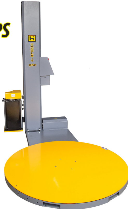
Part Number: SWM-SA-0850PS