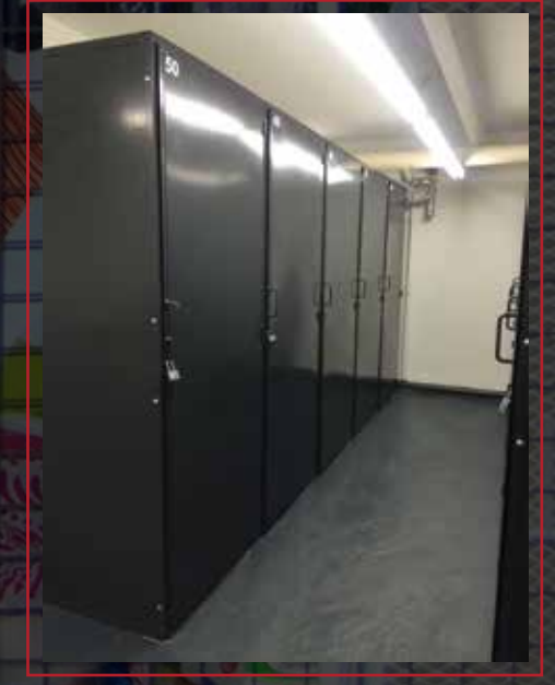
16 GA solid metal lockers are typically used when privacy is the main concern.