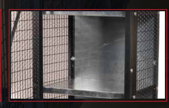
Back Panels 16 GA galvanized sheet metal or