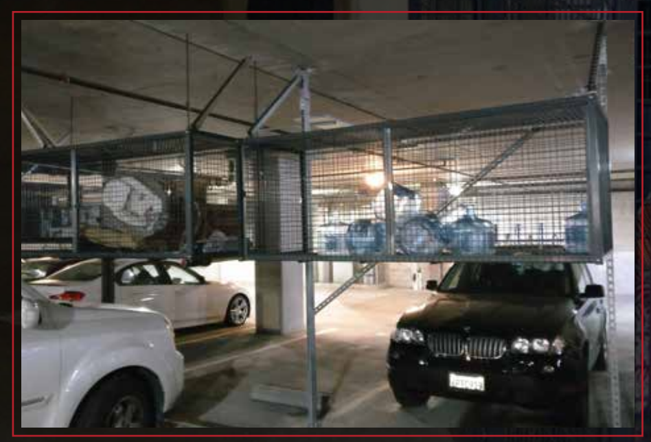
Storage for limited space. Typically 8' wide, 3' deep & 3' high. Hinged, double hinged or slide doors with padlock lugs are available.