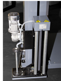
Electromagnetic film tension with easy film threading